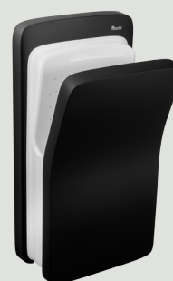
Matte Black SFF-PHBM