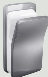
Pearl Grey SFF-PHPG